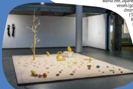
Image credit: Louise Weaver; no small wonder 2005 (detail) Hand crocheted lambswool and embroidered cotton thread over high density foam, walnut tree, Japanese rice wine vessels (gourds), ceramic, chromed abs plastic, ('Tangle' designed by Richard X. Zawitz 1981), lurex thread, nylon thread, cotton thread, Japanese silk, felt, Swarovski crystals, mirrored perspex, steel, plastic, fibreglass, granite, starfish, 'Fruit Light', designed by Geoffrey Mance. Nylon carpet, light, sound. Courtesy of the artist and Darren Knight Gallery, Sydney.

TICKETS: $20 Full $18 Members BOOKINGS: 5382 9555 www.horshamtownhall.com