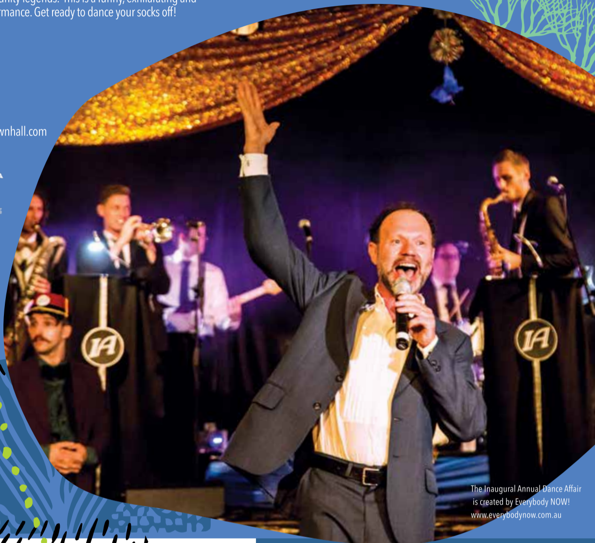
The Inaugural Annual Dance Affair is created by Everybody NOW! www.everybodynow.com.au

THE ART IS...FESTIVAL loves to explore and tell stories, your stories, crafted by the footprints we make as we live in the Wimmera. This year Art is... a Footprint making its mark through physical movement and human expression.