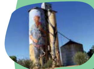
Image: Patchewollock Silo art, Fintan Magee mural depicts local sheep and grain farmer Nick "Noodle" Hurland

TICKETS: $7.00 (includes afternoon tea) BOOKINGS: 5382 9555 www.horshamtownhall.com.au