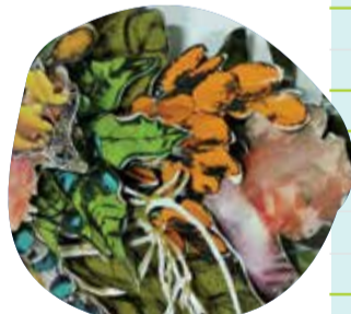
Image: detail 2004-9 Jeff Thomson, Bouquet IV 2004, screen printed corrugated steel corrugated iron, 122cm x 75cm x 11cm, Horsham Regional Art Gallery Collection